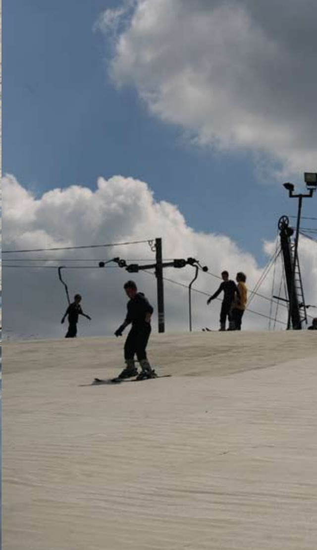
Local parks, nearby countryside and the outdoor ski centre.